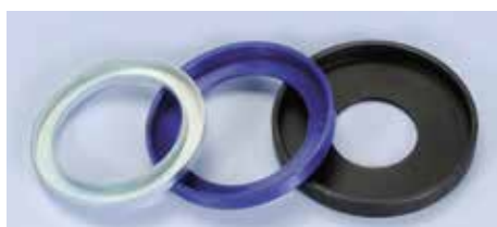
246.046 Yamaha TMAX