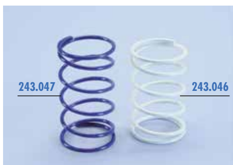
243.043 Piaggio ZIP EVOLUTION